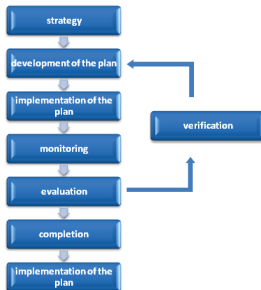
Fig. 2. Scheme of the deposit management process (based on Satter et al. 1994)