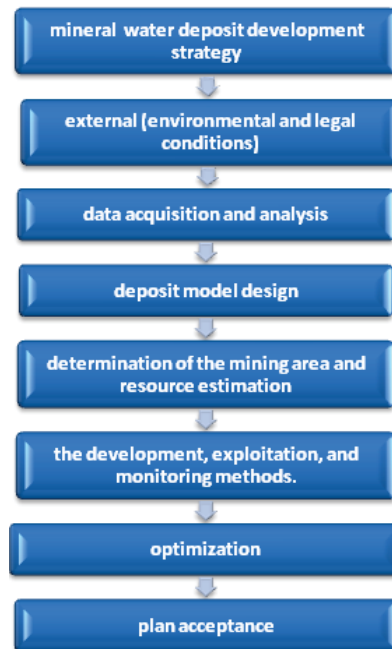
Fig. 3. Scheme of mineral water deposit development plan

Of all the above mentioned elements included in the mineral water deposit management process, the most important is the deposit development plan. The plan should be treated as a process that consists of many elements (Fig. 3).