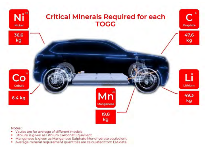
Fig. 1. Critical minerals required for each TOGG