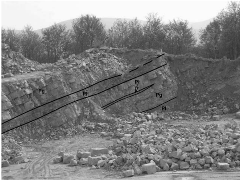
Fig. 5.1. Quarry “Lipowica II-1”. Coarse sandstones (Pg) and sandstones with shale interbeds (Pl)

The “Lipowica II-1” deposit consists of sandstone interbedded with shale to various degrees. According to the data made available in the geological documentation (Niec et al. 2003), the most valuable part of the deposit is exposed in the eastern part of the quarry. It consists of thick-bedded sandstone, which in places is interbedded with very thin interbeds of shale (Fig. 5.1) proportion of which does not exceed 3–5% of the volume of this part of the deposit. In the remaining, smaller part of the open pit, medium- and thin-bedded sandstone are exposed and the proportion of the interbedded shales ranges from a few % to 90%. The average amount of shale interbeds within the whole deposit is estimated to be around 12%.