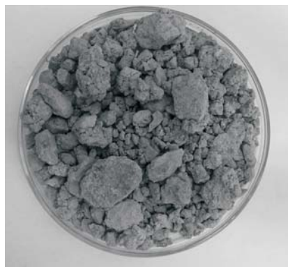
Fig. 3. Sample taken from the heap in Radoniów