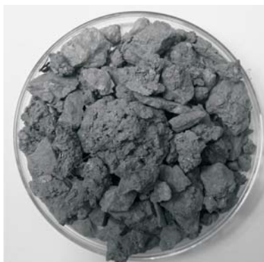
Fig. 5. Sample taken from heap 17 in Kowary – Podgórze