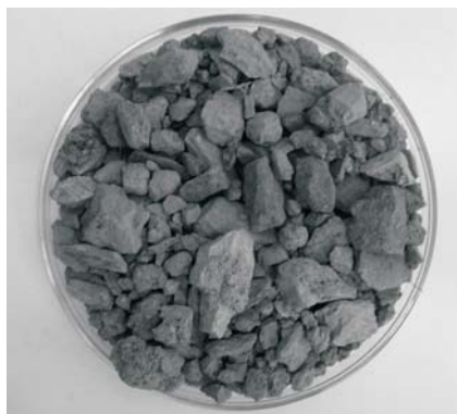
Fig. 2. Sample taken from heap 19 and 19a in Kowary – Podgórze