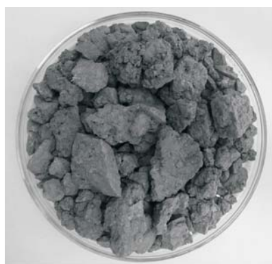
Fig. 4. Sample taken from heap 16 in Kowary – Podgórze