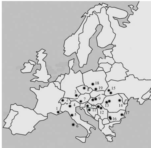
Fig. 2. Distribution of main Cenozoic meta-lignite and sub-bituminous coal deposits and their uneconomic occurrences in Europe. Coal ranking – see in Table 3