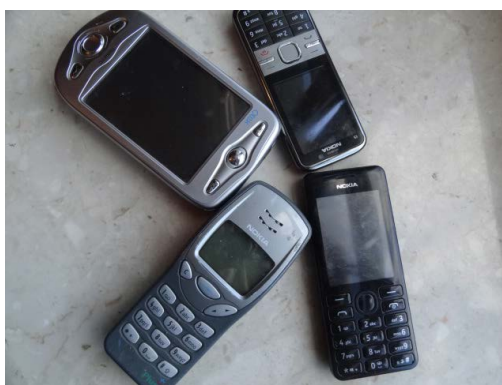
Fig. 2. Spent mobile phones hidden in a drawer of one of authors

inefficiency, but because of their replacement by new and better devices. As they are really small devices, they are very often stored or even disposed of with household waste (Buchert et al. 2012). It is very common that each person using mobile phones has 2, 3 or even more older devices “hidden in a drawer” (Fig. 2). This is why the mobile phone end-of-life recycling rates are still extremely low, commonly only several %, while for other, larger WEEEs (e.g. PCs, laptops) these rates are much better. So, spent (end-of-life) mobile phones are very important, but still mostly unused, a secondary source of many metals. The potential of metal recovery from spent mobile phones (SMPs) and their conditions are analyzed in the paper.