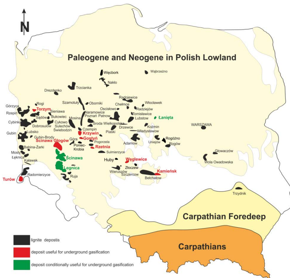
Fig. 2. Location map of lignite deposits useful for underground gasification (according to Bielowicz and Kasiński 2014 ; Matl et al. 2015 )

As can be seen, only 10 out of from 166 lignite deposit meet the criteria for the potential development of underground gasification process (Fig. 2).